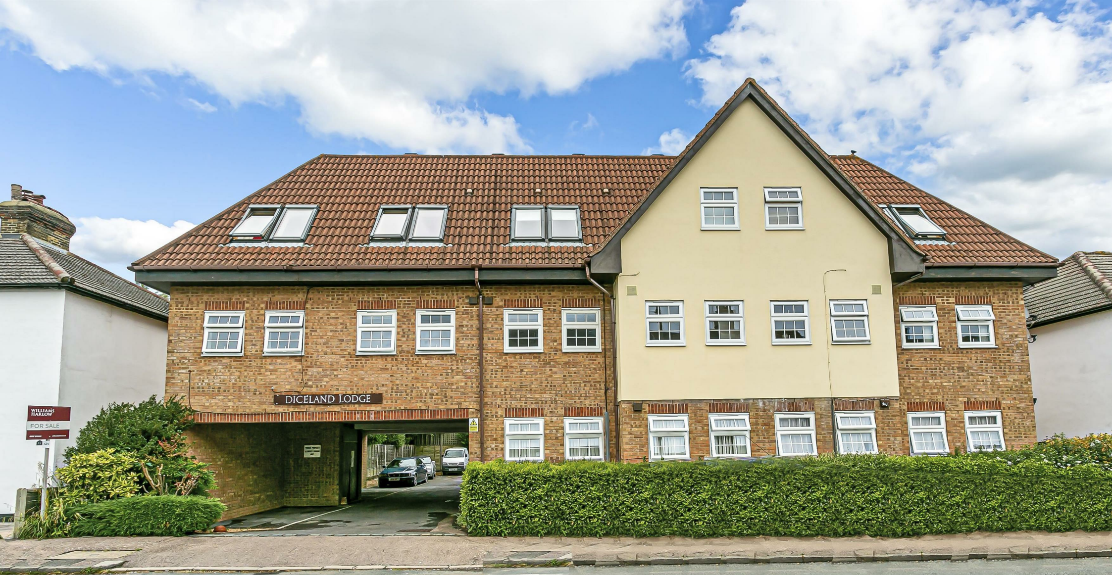
Diceland Lodge, Banstead, Surrey SM7 2ET £900 PCM